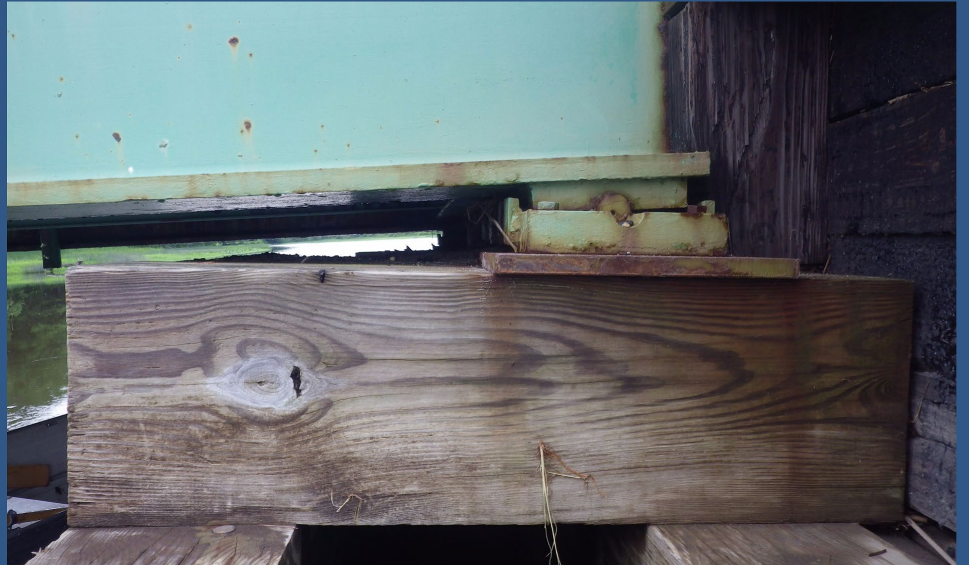
Southeast bearing support