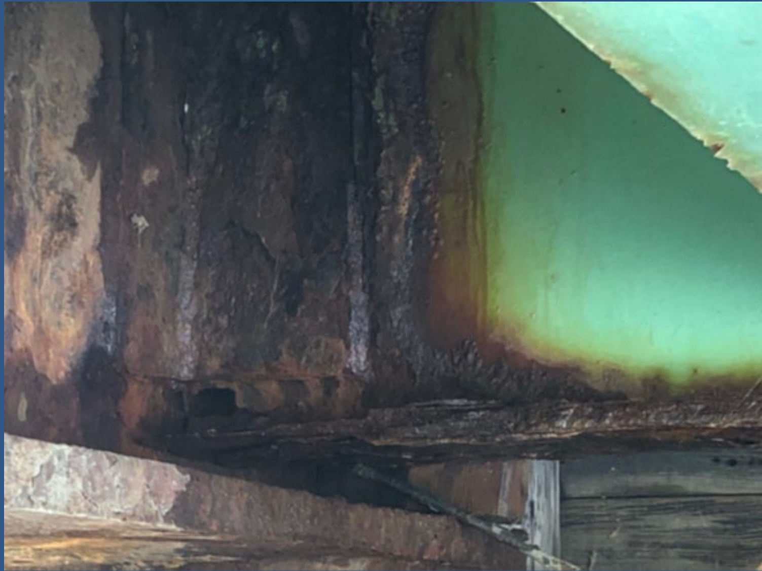
East Floor Beam End Connection