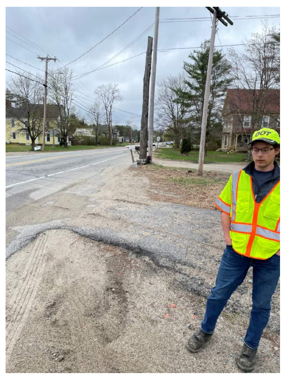
#9: Mountain Division Trail at Rte. 113 in Standish looking south