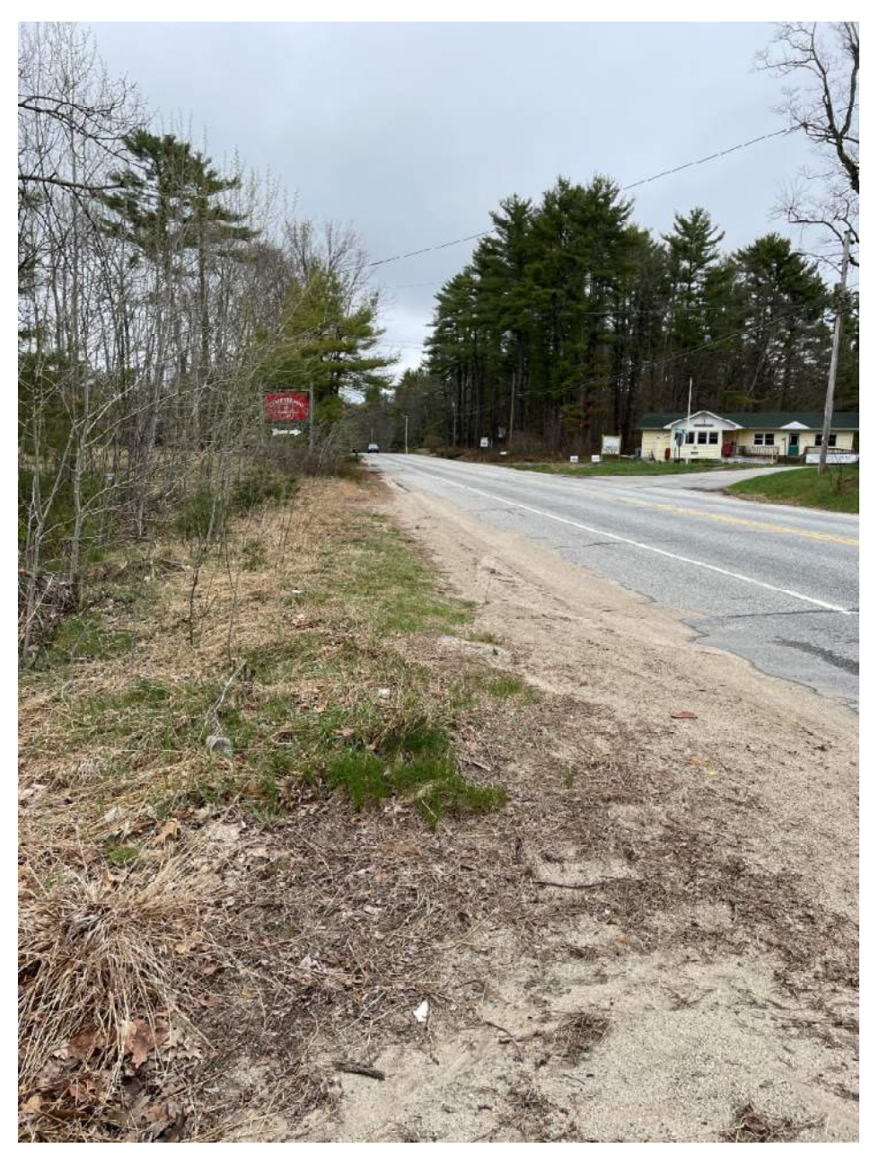
#11: Mountain Division Trail at Rte. 114 in Standish looking north