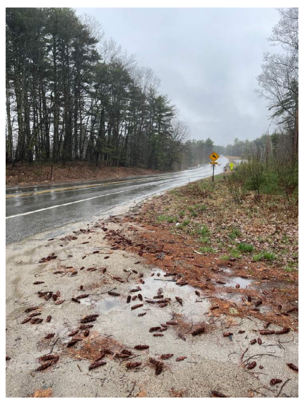
#13: Mountain Division Trail at Rte. 35 in Standish looking north