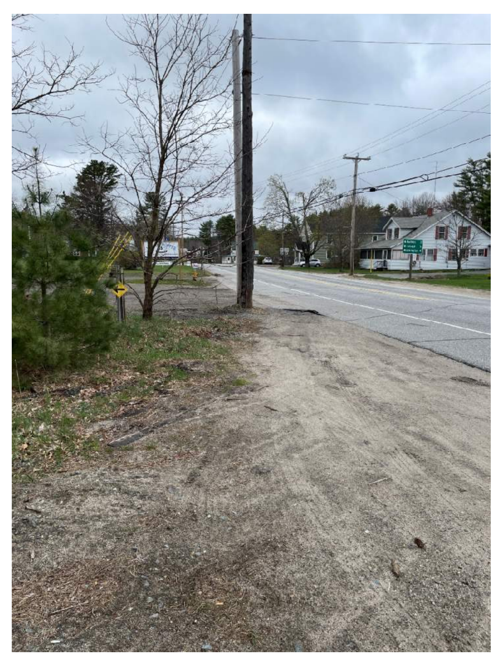
#10: Mountain Division Trail at Rte. 113 in Standish looking north