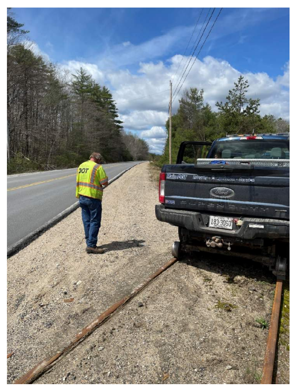
#3: Mountain Division Trail at Rte. 113 in Hiram looking north