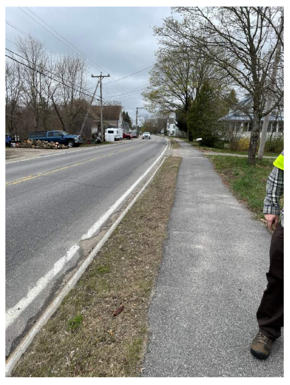
#8: Mountain Division Trail at Rte. 11 in Standish looking South