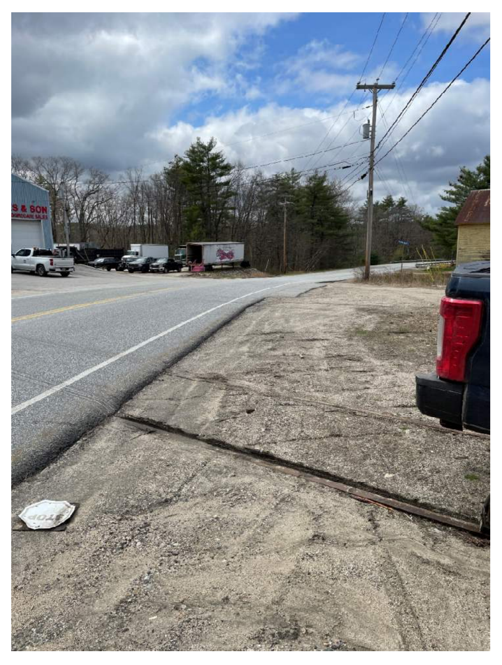
#6: Mountain Division Trail Rte. 5/117 in Baldwin looking south