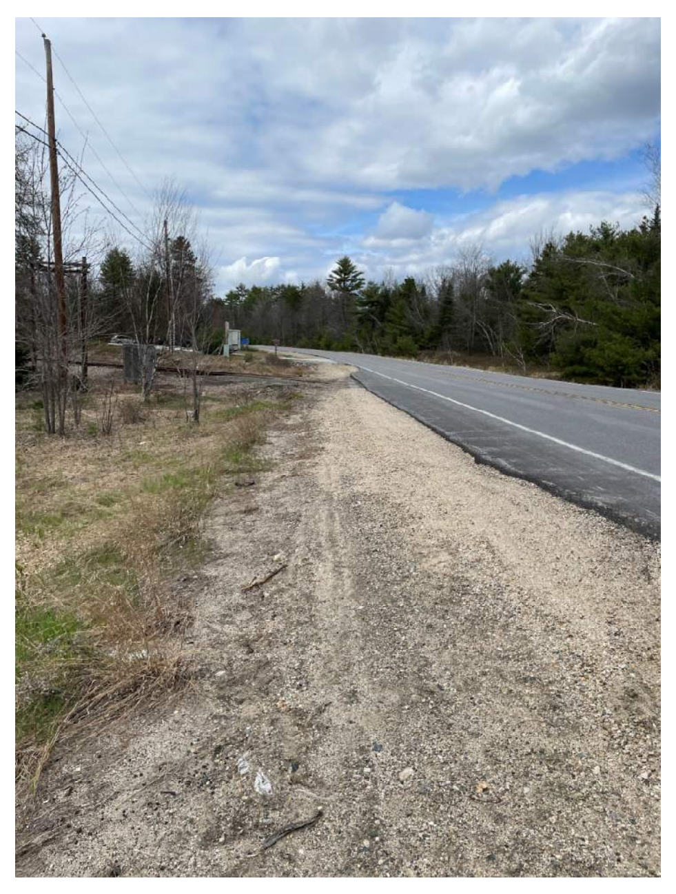
#1: Mountain Division Trail at Rte. 113 in Fryeburg looking North