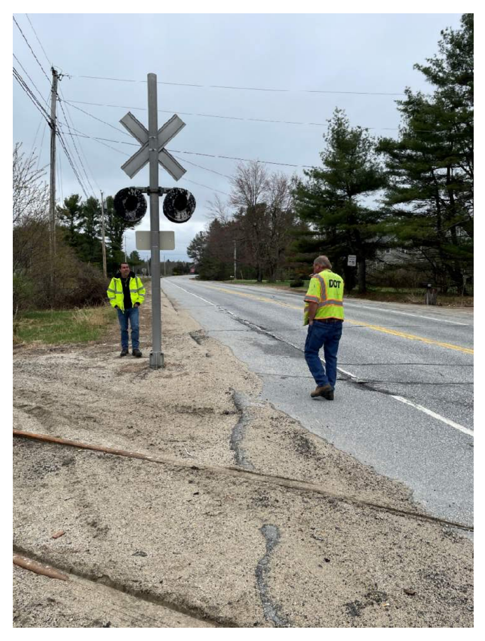
#12: Mountain Division Trail at Rte. 114 in Standish looking south