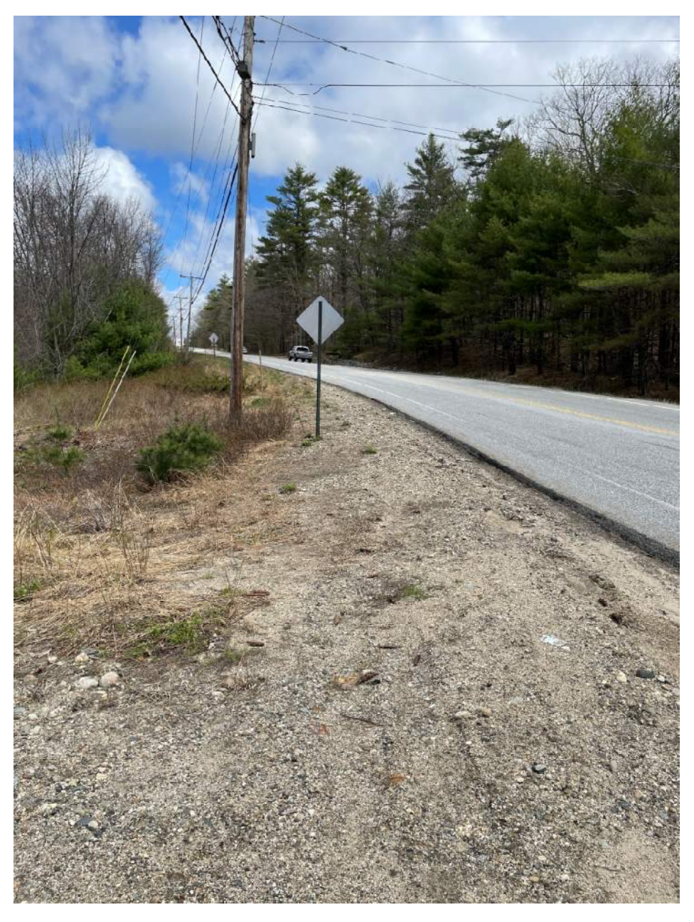
#5: Mountain Division Trail at Rte. 5/117 in Baldwin looking north