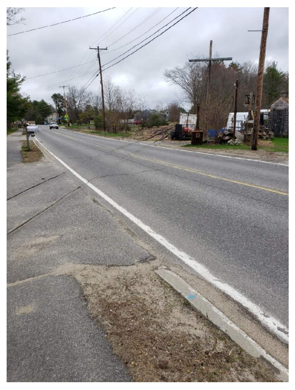
#7: Mountain Division Trail at Rte. 11 in Standish looking North