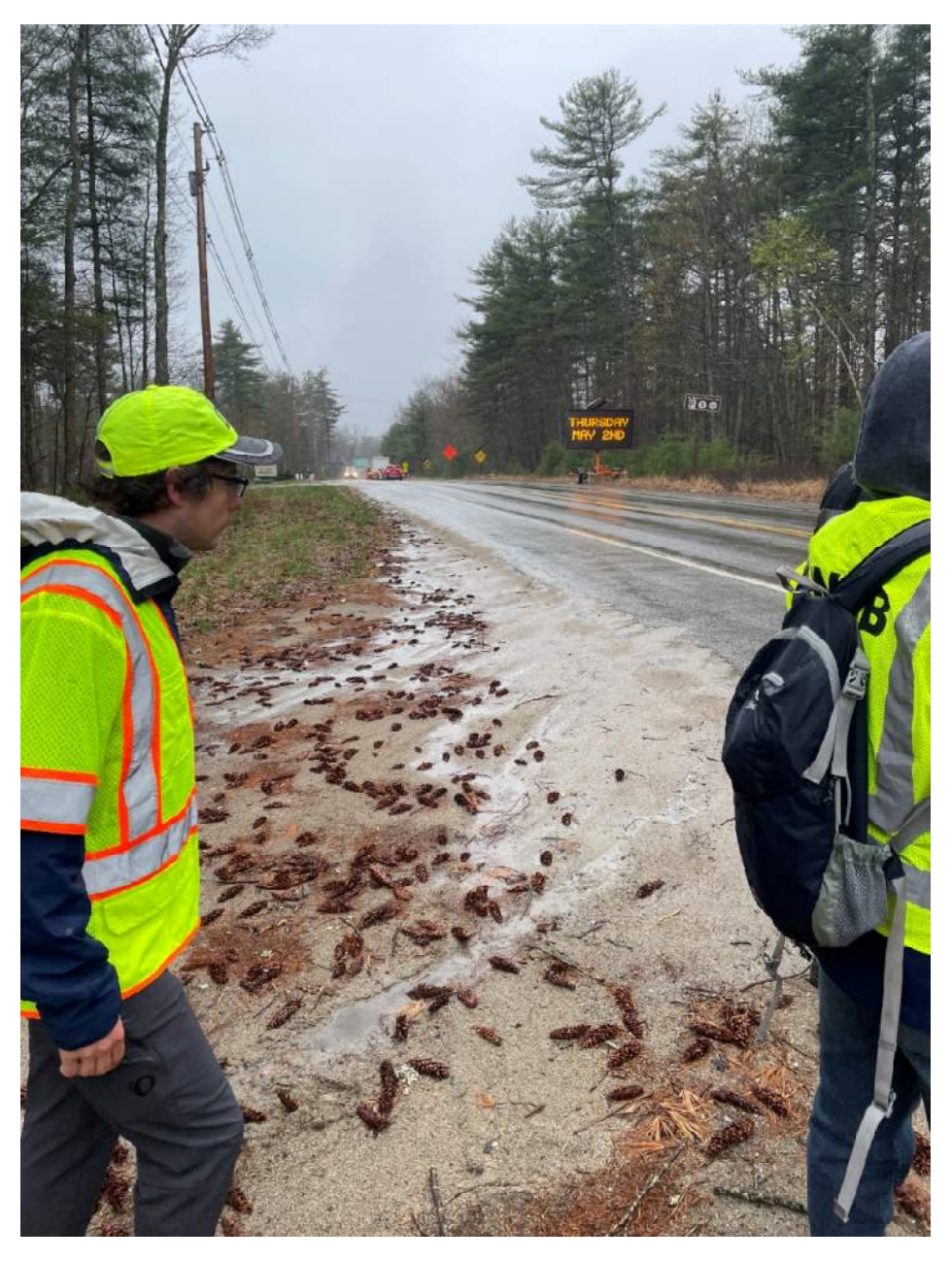
#14: Mountain Division Trail at Rte. 35 in Standish looking south